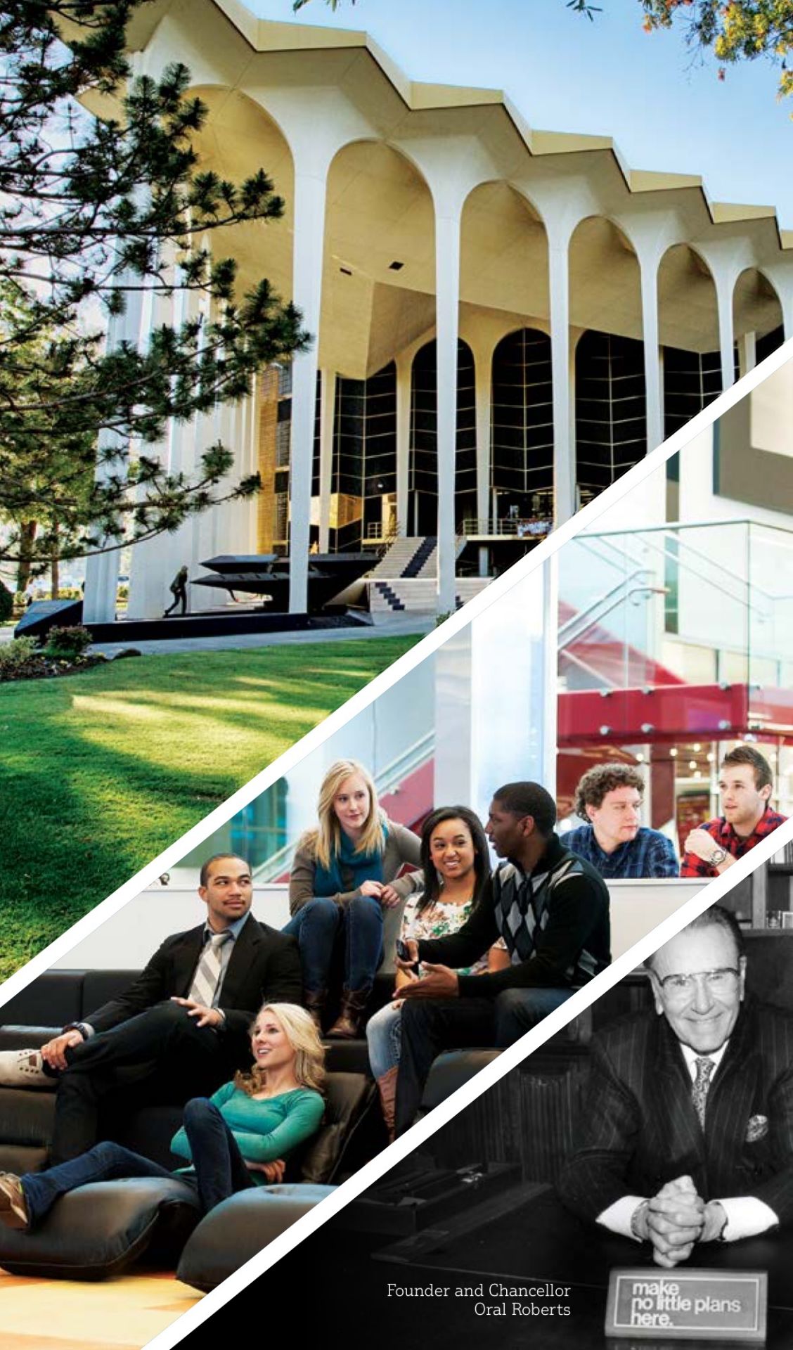
Founder and Chancellor Oral Roberts