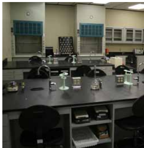
The new biochemistry lab on the GC3 chemistry hallway is near completion. ORU provided the funds for the remodel while alumni funds are being used to equip the lab with the up-to-date biochemical instrumentation.

The faculty have been busy teaching and conducting research along with other scholarly activities; some of which are described later in the newsletter.