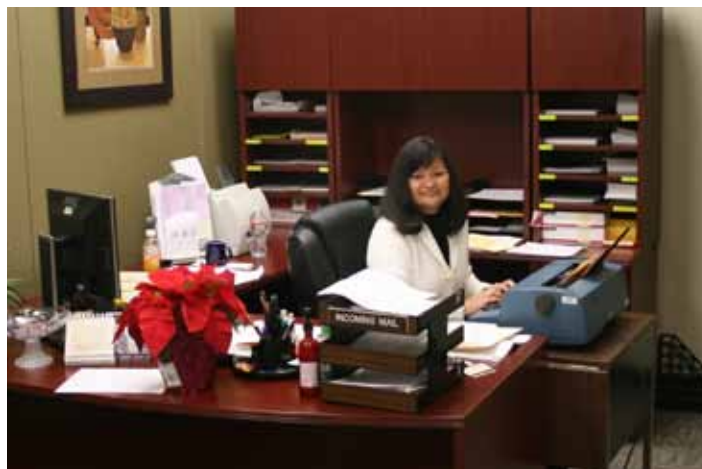
Thanks to the efforts of ORU Operations the department's office and the adjacent chair's office was expanded and renovated to handle the increasing flow of students and faculty. Alumni funds allowed us to buy new desks and furniture making these areas more spacious, efficient, and of course, more pleasant for all of us!