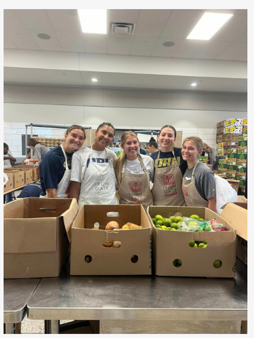
ORU women's soccer team at Iron Gate Tulsa