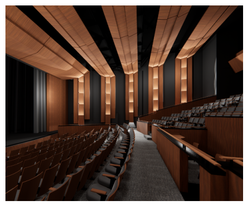
Rendering of the theatre in the Peggy V. Helmerich MAC