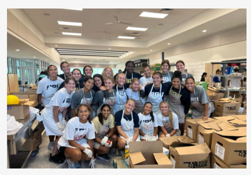
ORU women's soccer team at Iron Gate Tulsa