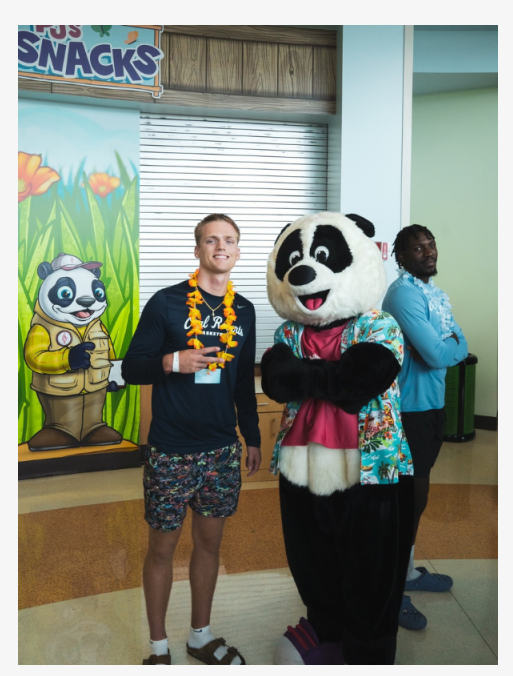
ORU men's basketball team at St. Francis Children's Hospital