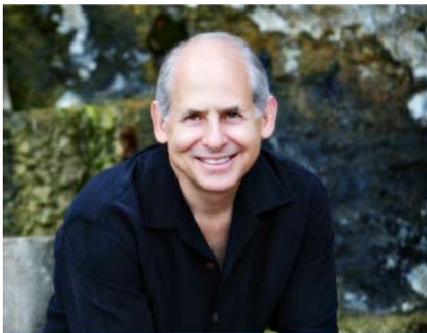
SPECIAL SPEAKER DR. DANIEL G. AMEN, MD

Daniel G. Amen, MD is a award-winning physician, child and adult psychiatrist, brain imaging specialist, best-selling author, international speaker, and brain enhancement expert. He is a Distinguished Fellow of the American Psychiatric Association and the CEO and medical director of Amen Clinics, Inc. (ACI) in Newport Beach and Fairfield, California, Tacoma, Washington and Reston, Virginia. Dr. Amen is married, father of four children, and an avid table tennis player.