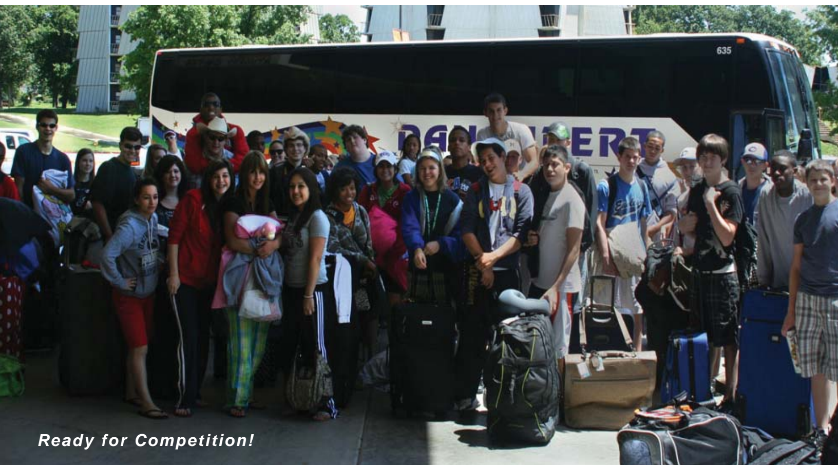
Ready for Competition!