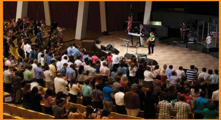
Wednesday evening Chapel Service