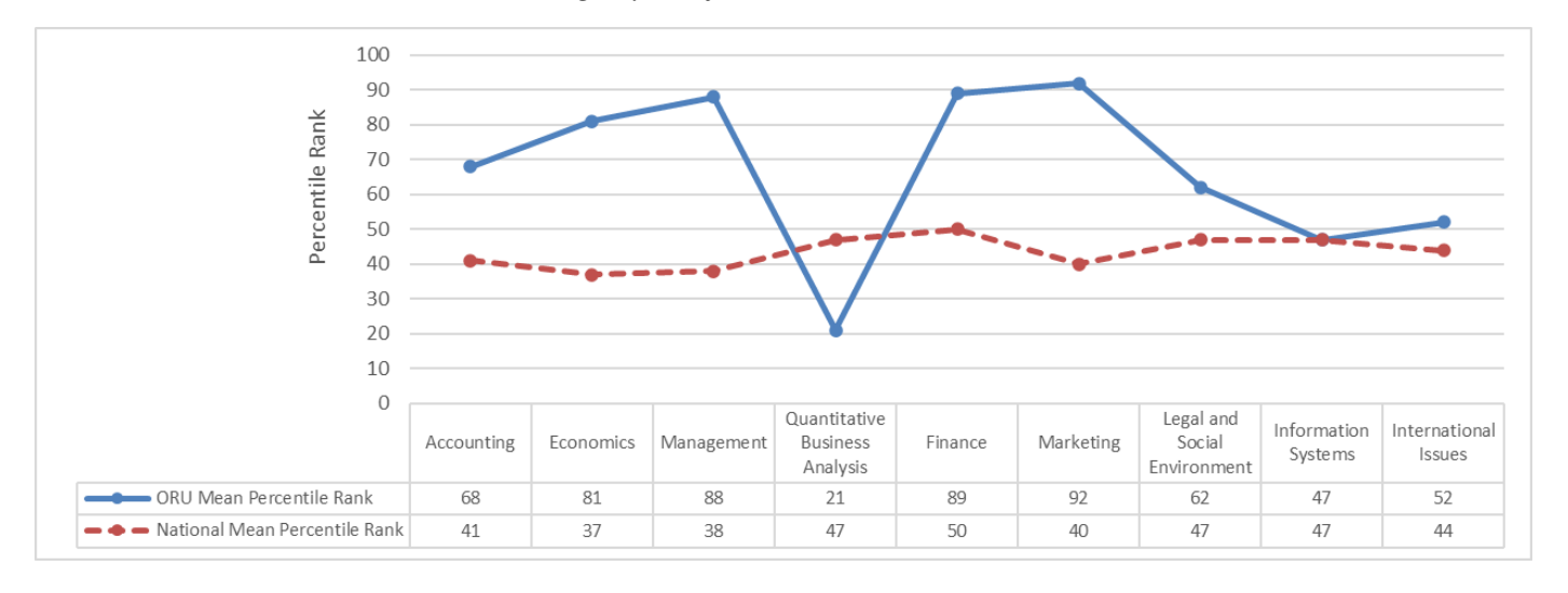
Figure 2 ORU vs Institutional Percentile Rankings by Subject (Assessment) Area, Fall 2023

The mean percentile ranking by subject area for ORU vs the mean MFT Institutional ranking by subject area is given in Figure 2. Apart from Quantitative Business Analysis and Information Systems (which is not taught in the F&FCOB), ORU's mean percentile rank was higher than the Institutional percentile rank for the remaining assessment areas.