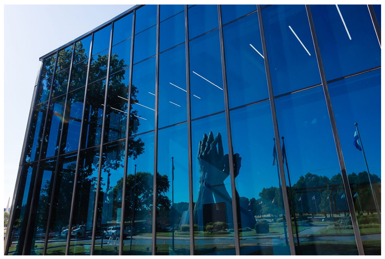
New Welcome Center Grand Opening September 14

The grand opening of the new Welcome Center will take place right after chapel on Wednesday, September 14 with a ribbon-cutting and dedication ceremony. Members of the ORU family will be joined by a number of special guests as the first of the Whole Leaders for the Whole World campaign's four buildings makes its debut. If you are in Tulsa, come join us! You can also watch the ceremony on Facebook Live.